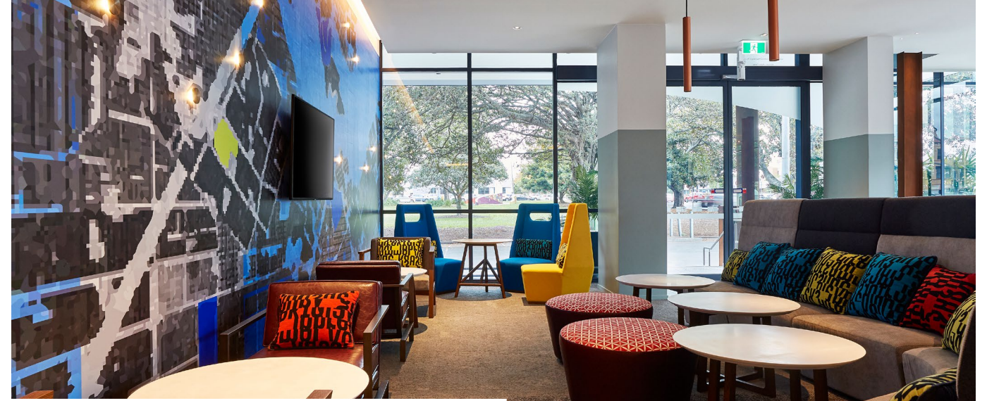
Carbon neutral modular carpet reduces installation and refurbishment waste.

We have continuously built on our sustainability commitments and increased ESG best practices across our entire portfolio of assets.